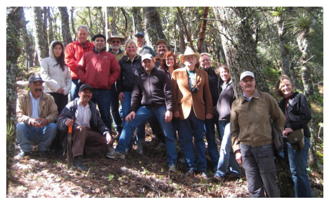
Members of the Forest Genetic Resources Working Group with guides and technical staff from lxtepiji, Oaxaca, posing in a stand of Pseudotsuga menziesii , 2009.

The Forest Tree Improvement Working Group was established at the second NAFC meeting in 1963. Its name was changed to Forest Genetic Resources Working Group in 1994. This group is dedicated to the conservation of forest genetic resources and their practical uses.