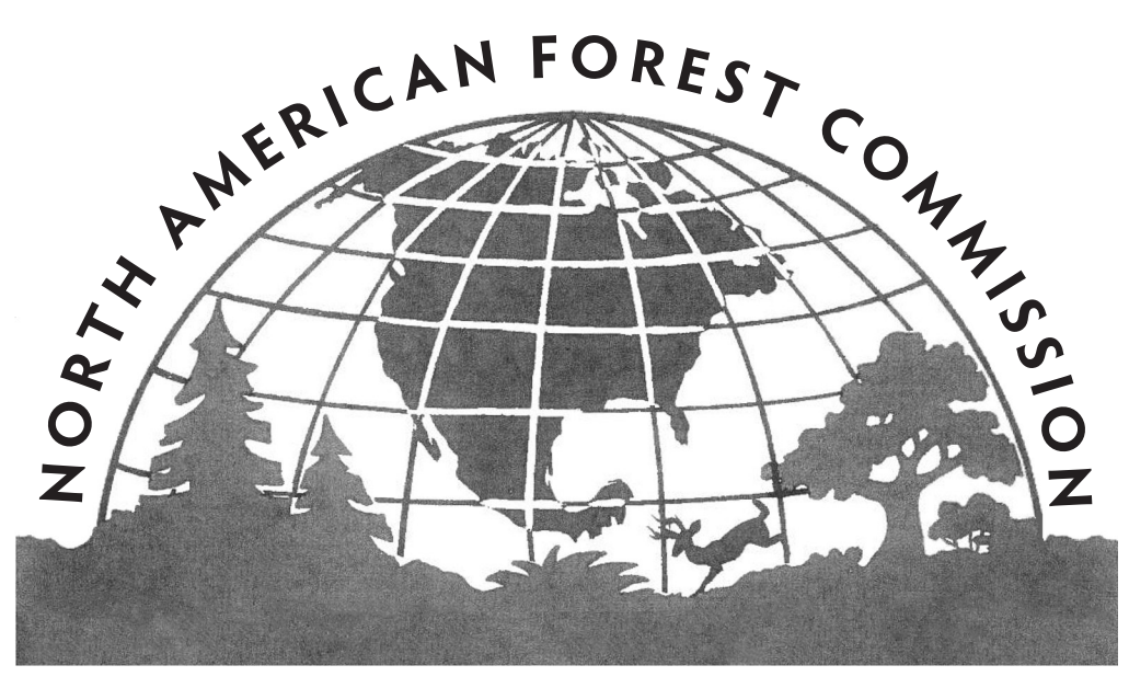
CANADA • UNITED STATES • MEXICO